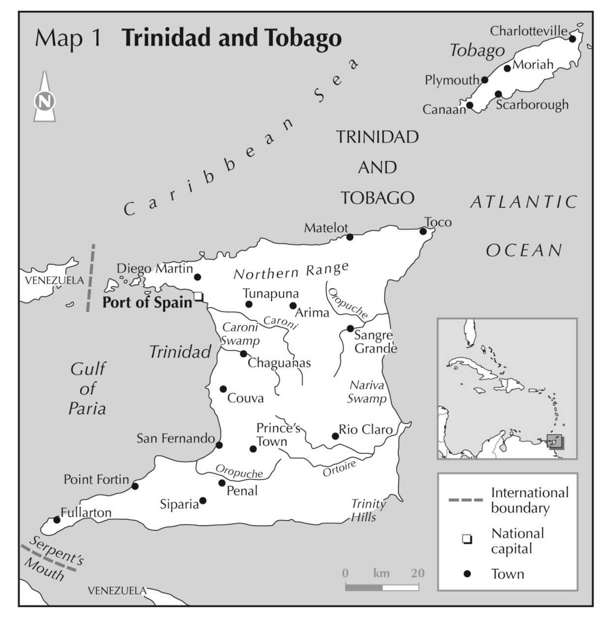
Fig. 2. Map of Trinidad (cartography by MAPgrafix).