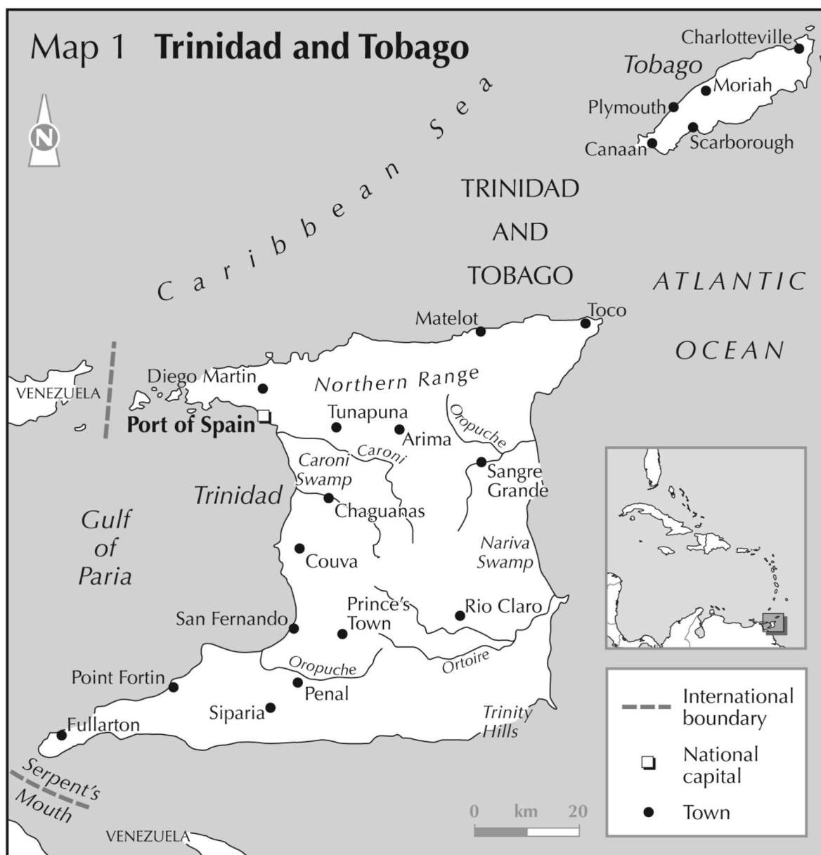
Fig. 2. Map of Trinidad (source: Small Arms Survey, cartography by MAPgrafix).